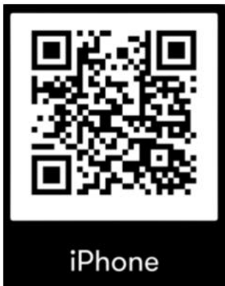
GPS MAPS CAMERA

ALL photos must be properly geotagged using the below app: